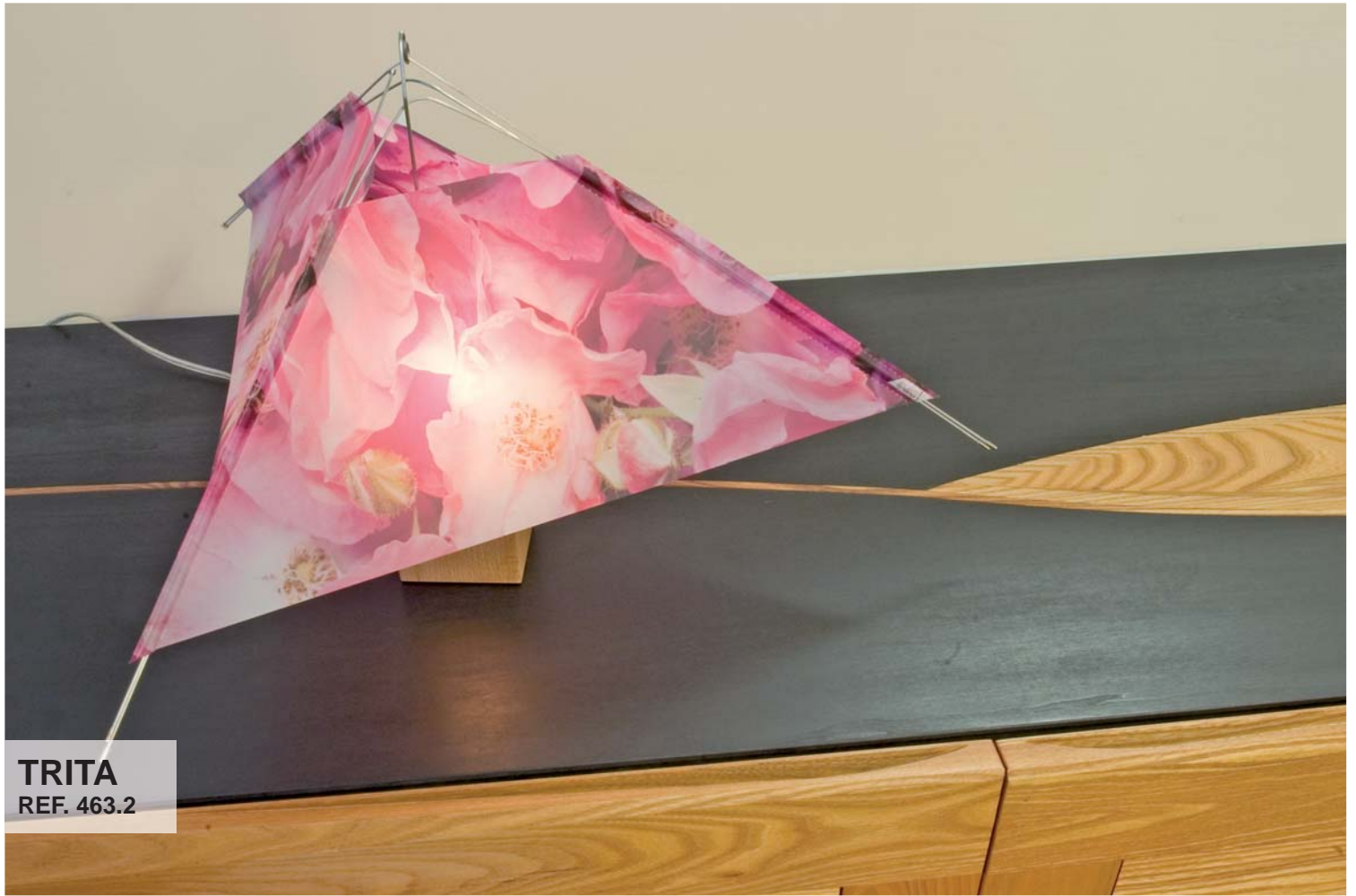
TRITA REF. 463.2