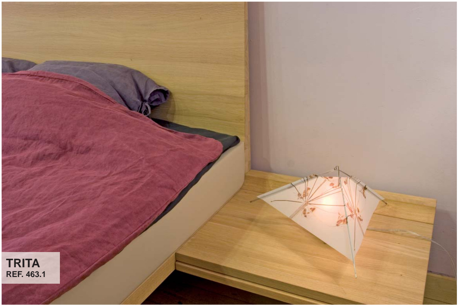
TRITA REF. 463.1