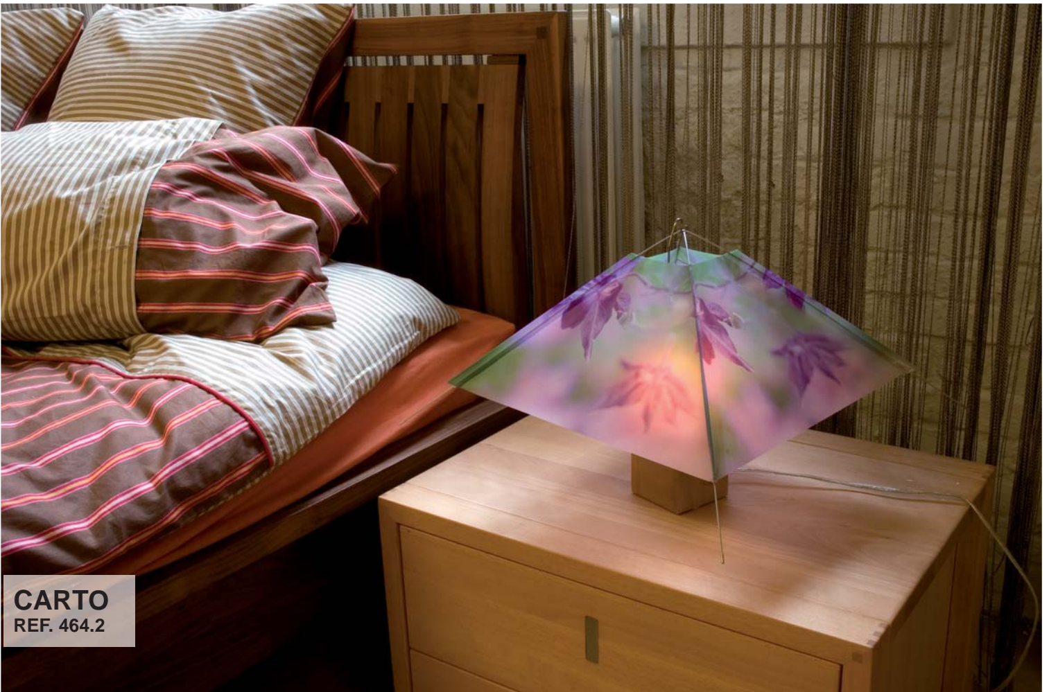
CARTO REF. 464.2