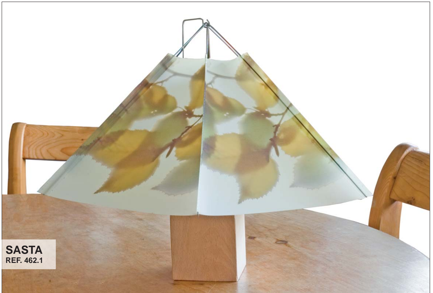
SASTA REF. 462.1