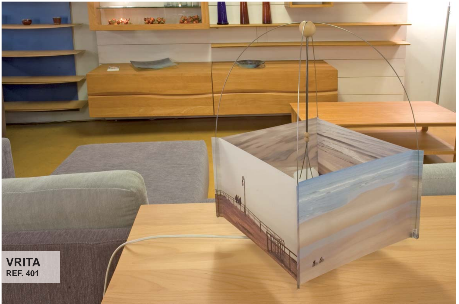
VRITA REF. 401