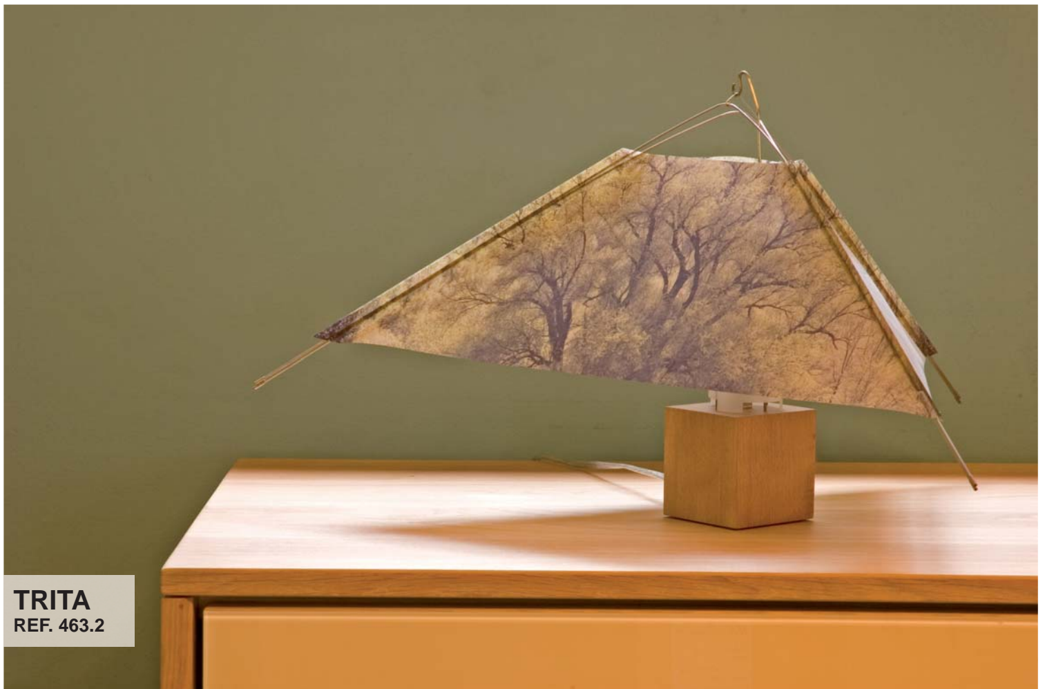
TRITA REF. 463.2