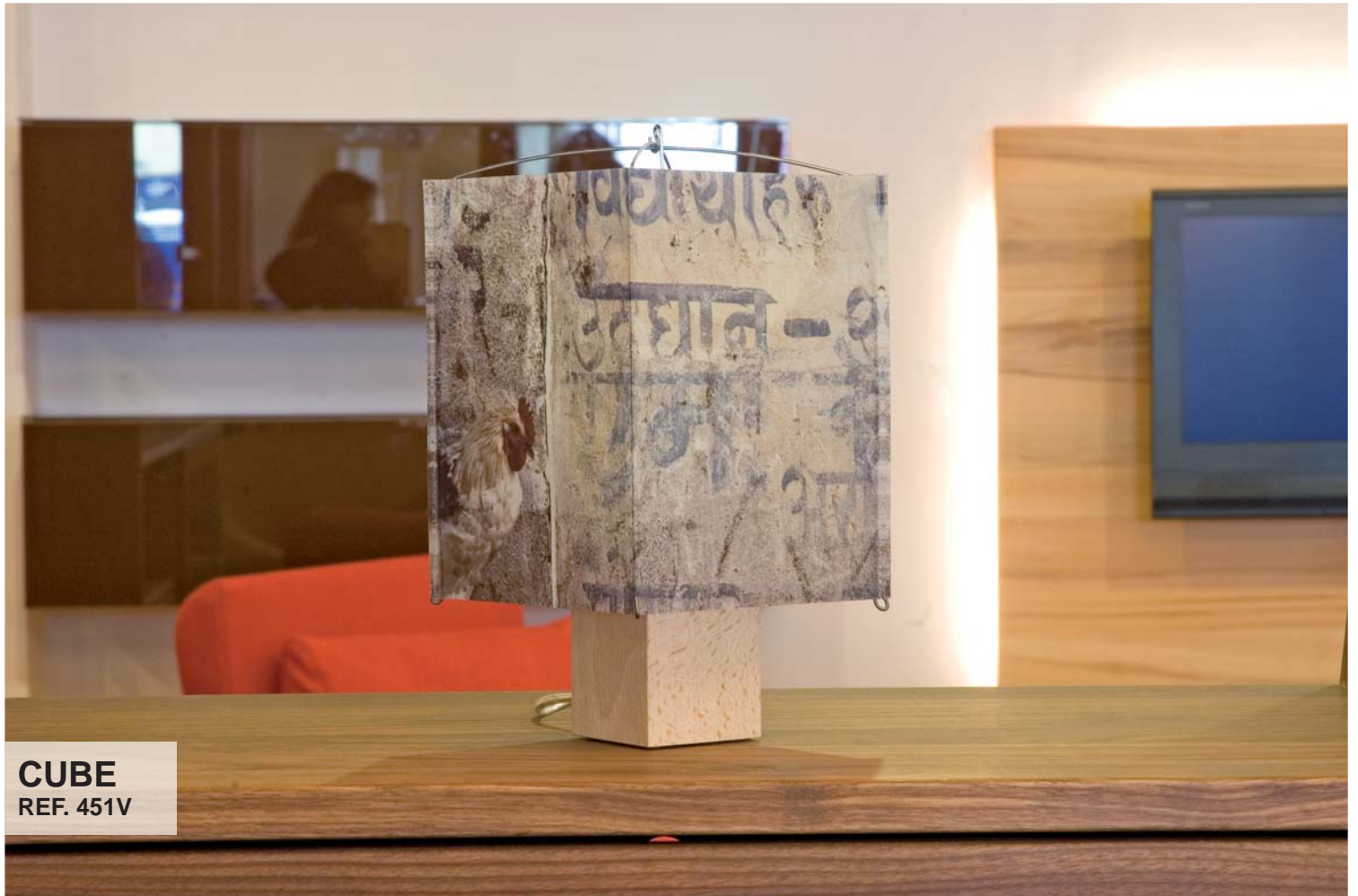
CUBE REF. 451V